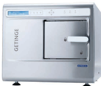
Getinge K5+ 15L W526 x D570 x H485mm