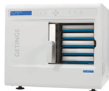
Getinge K7+ 20L W526 x D620 x H485mm