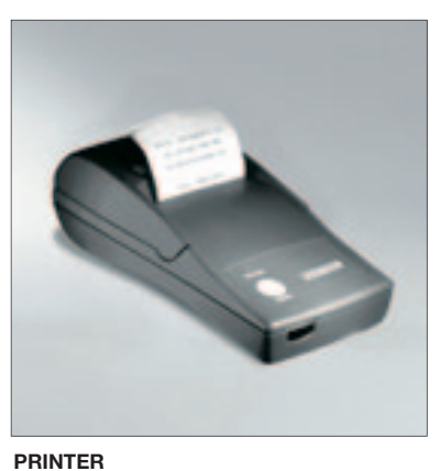
The printer provides a detailed report with all information about the completed cycle.

DOSING PUMPS Tablo is equipped with 2 dosing pumps with flow control for detergent as an option. Two extra dosing pumps are also available for combining with enzyme, lubrication and neutralizer.