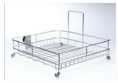
BASIC CART w. BLIND DOCKING Blind docking comes as standard. When choosing MIS or Luer Bar the cart will be delivered without blind docking.

Getinge offers a complete range of loading equipment specially designed to assure efficient cleaning.