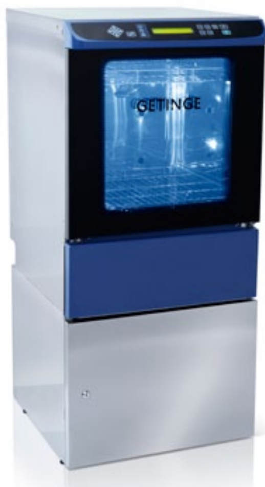
Claro is also available with a stainless steel cabinet for a more ergonomic work height. The cabinet is also a perfect place to store detergents and other consumables.